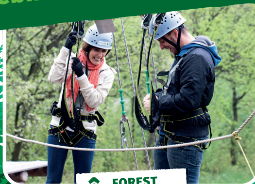
FOREST ROPE PARK

All information on: erlebniswelt-kahlenberg.at/en_us/